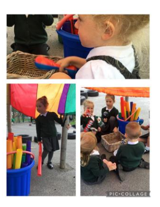
Year 1 had an amazing time exploring

Nursery have been exploring sound with instruments